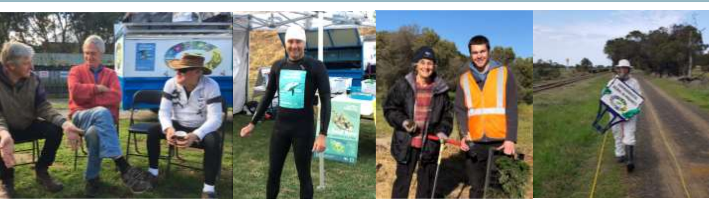
L - R: Friends of the Bellarine Rail Trail, 2XU Triathlon, Fellows Rd Revegetation Day, Landcare Weed Control

Bellarine Catchment Network has many ongoing annual projects and programs with our partner organisations and many educational institutions. For individual reports for any program or project, please email info@bcn.org.au .